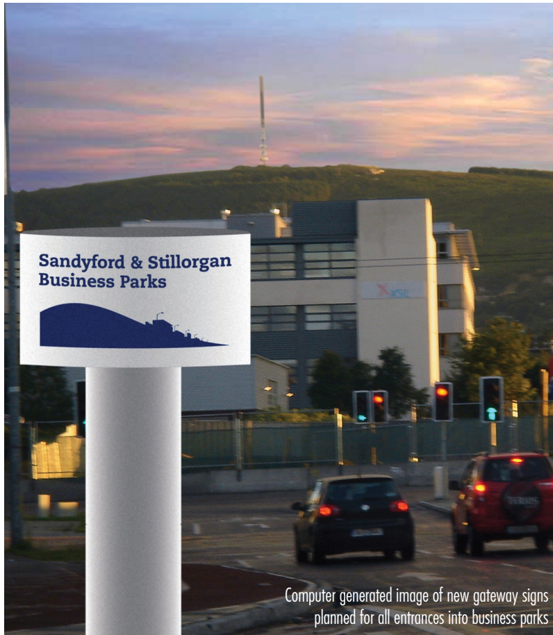
Computer generated image of new gateway signs planned for all entrances into business parks