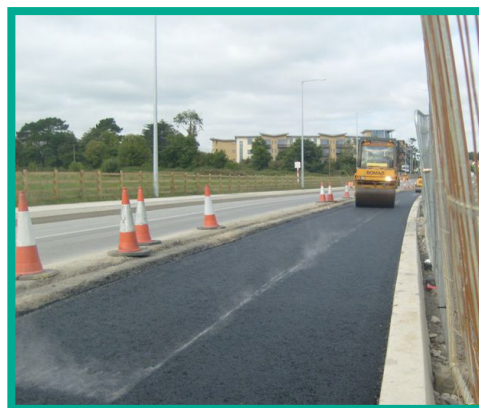
Road finishing works at Ballyogan road