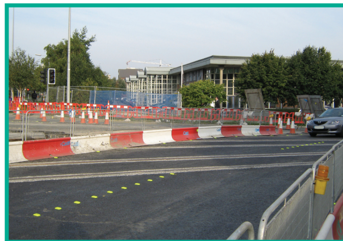
Tracks at Burton Hall road junction