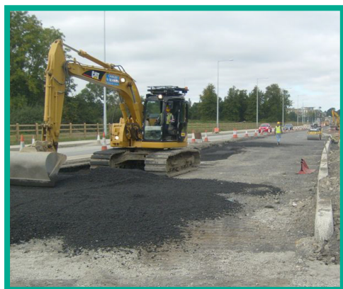
Road finishing works at Ballyogan road

The construction of the boundary walls is complete from Glencairn Heath to Leopardstown Valley. A new 300mm watermain has been commissioned from Ballyogan Avenue East to Ballyogan Wood. The track bed is complete and ready for the rail contractor to begin works from Ballyogan Avenue West to Ballyogan Wood. Deep drainage and utility diversion works shall continue throughout October.